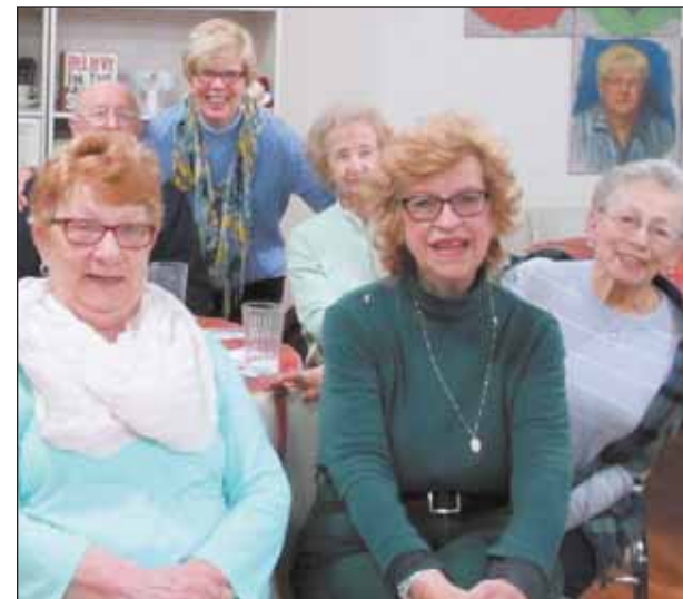
ST. PETER SENIOR MINISTRY, ST. PETER CHURCH

"Prime Timers supports and encourages senior members on their spiritual journey within their parish family. And, since seniors are active and vital members of the parish family, this three times a week gathering provides a perfect forum for fun, socialization and sharing."