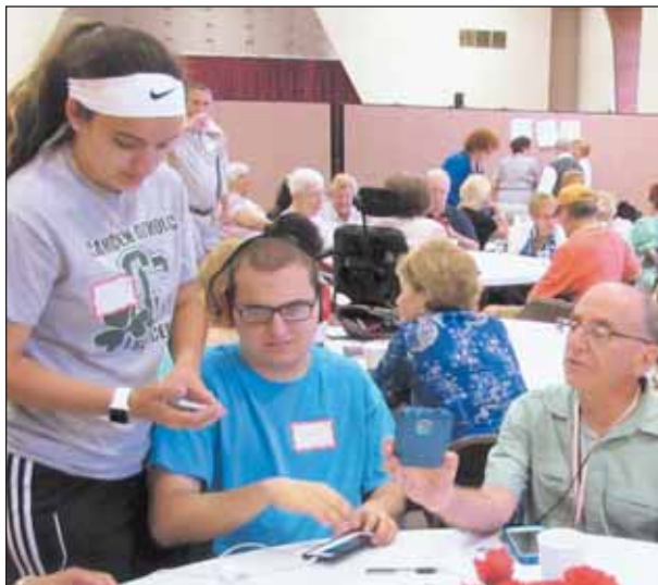
RENAISSANCE CENTER SENIOR MINISTRY, ST. ANDREW THE APOSTLE