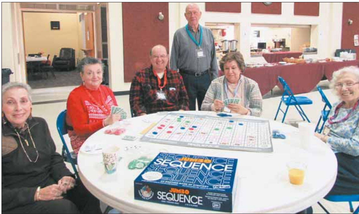
PRIME TIMERS, CHURCH OF THE INCARNATION

"Everything about Prime Timers is enjoyable. It enhances the quality of our lives – it is like having another family".